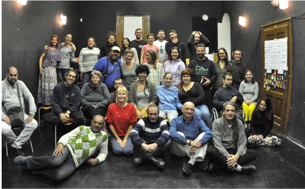
PROJECT — 2018